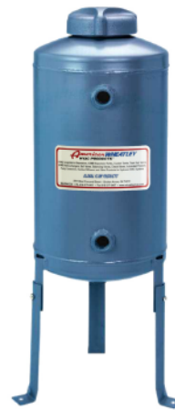
DISHED BOTTOM OUT-STYLE